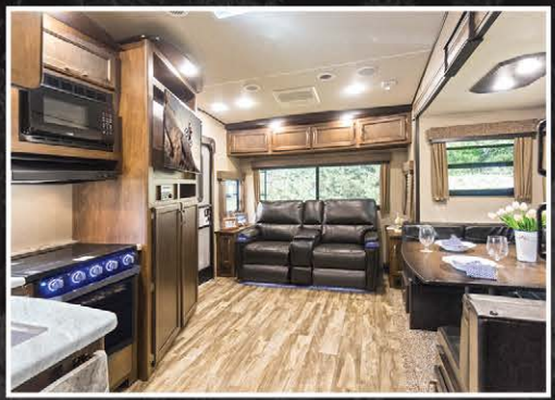
Spacious Living/Galley Area (230RL Shown)