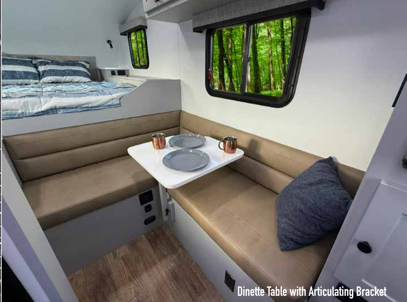
Dinette Table with Articulating Bracket