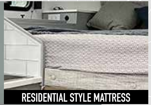
RESIDENTIAL STYLE MATTRESS