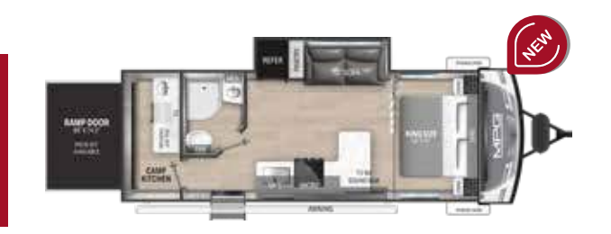
Length - 28 ′ 9 ¼″ | Height - 11 ′ 3″ | Cargo - 1,550 lbs Dry Weight - 6,214 lbs | GVWR - 7,796 lbs | Sleeps - 3-4