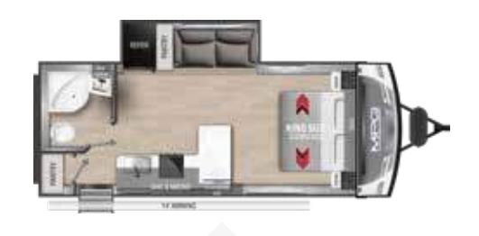
Length - 25´11″ | Height - 11´3″ | Cargo - 2,296 lbs Dry Weight - 5,352 lbs | GVWR - 7,680 lbs | Sleeps - 3-4