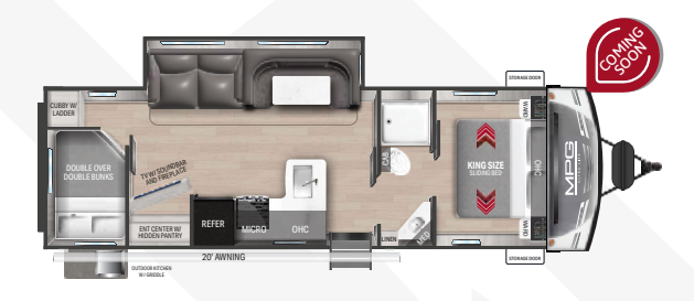
Length - 33´11″ | Height - 11´6″ | Cargo - TBD lbs Dry Weight - TBD lbs | GVWR - TBD lbs | Sleeps - 9+