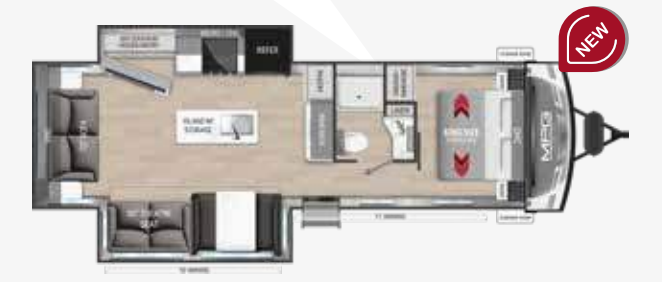
Length - 34´11″ | Height - 11´6″ | Cargo - 2,306 lbs Dry Weight - 7,590 lbs | GVWR - 9,928lbs | Sleeps - 5-6