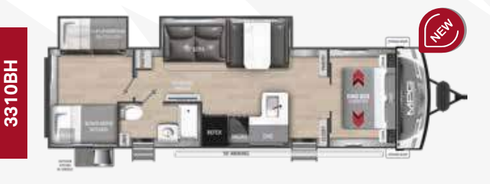
Length - 37´11 | Height - 11´6" | Cargo - 2,132 lbs Dry Weight - 7,802 lbs | GVWR - 9,966 lbs | Sleeps - 9+