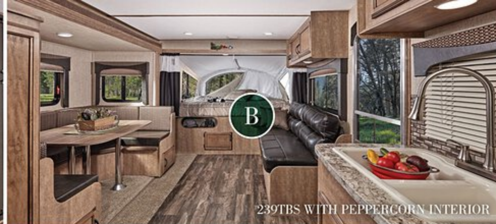
239TBS WITH PEPPERCORN INTERIOR