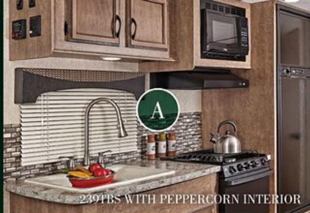
239TBS WITH PEPPERCORN INTERIOR