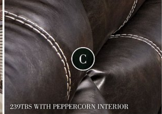
239TBS WITH PEPPERCORN INTERIOR