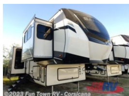
New 2023 Prime Time Sanibel 3802WB $67,777