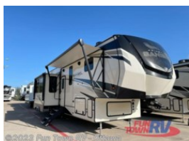
New 2023 Prime Time Sanibel 3602WB $75,039