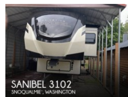
Used 2022 Prime Time Sanibel 3102 $59,600