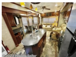
Used 2014 Prime Time Sanibel 3050 $27,500