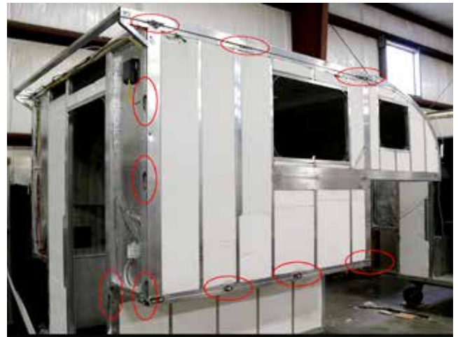
STRUCTURE SCREWED & WELDED TOGETHER

You will not find any wood in our framework - in fact, our entire structure is welded together to form a strong, UNI-BODY construction that will stand the test of time and the