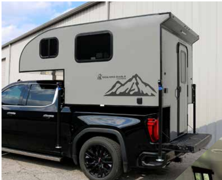
6.5XL Shown on a 5.5' bed.

Shown above in our new Platinum Gray exterior fiberglass option, the ADLAR 6.5XL offers sleeping areas both in the upper deck and in the roomy dinette that quickly makes into a bed.