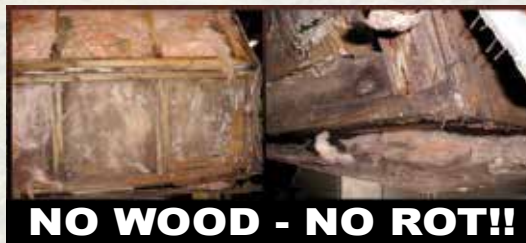
NO WOOD - NO ROT!!

The dinette bases in the Soaring Eagle Campers' Adlar models are crafted out of high-tech composites that are both lighter than wood and much longer lasting.