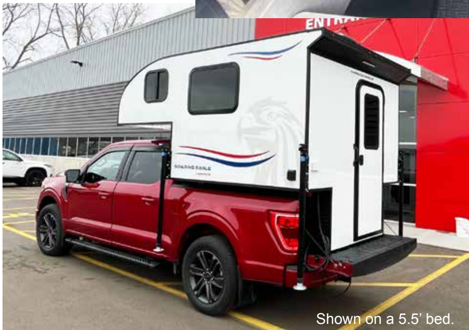
Shown on a 5.5' bed.

A popular option is our North-South pull-out queen bed designed for couples who want the extra room for sleeping.