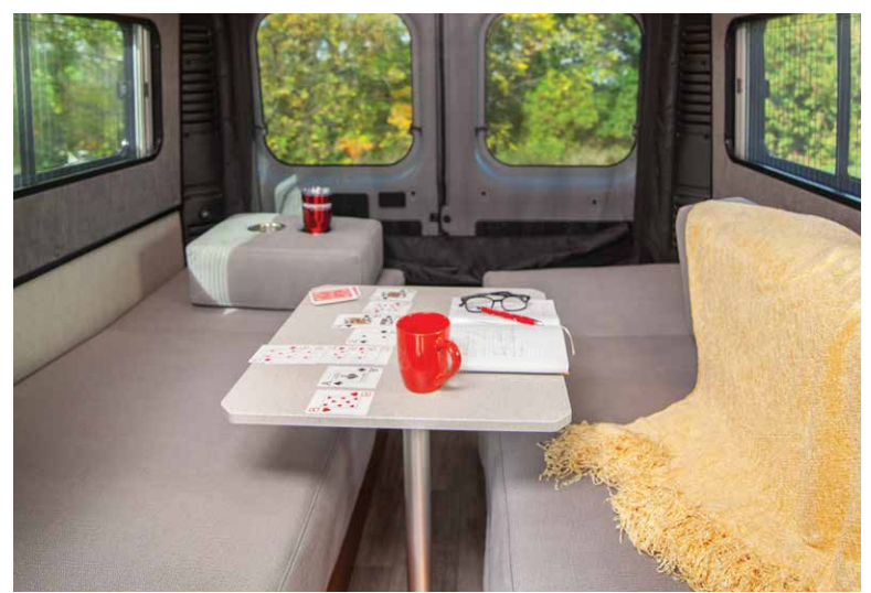
Rear lounge and twin bed area offers a great place to relax, work or dine.