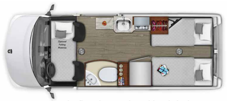
Interior floorplan evening with twin bed set up. (Shown with optional front folding mattress.)