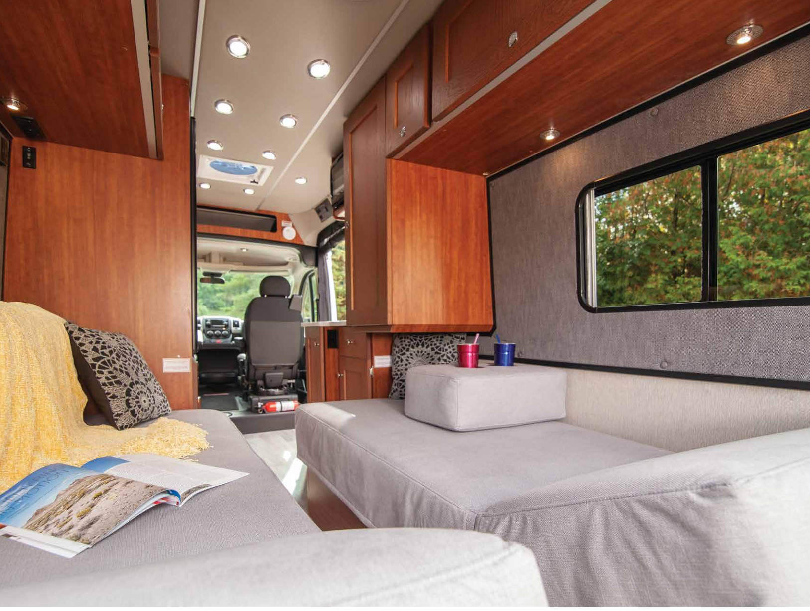
Open aisle floor plan allows for flexibility in sleeping accommodations and storage of large items.