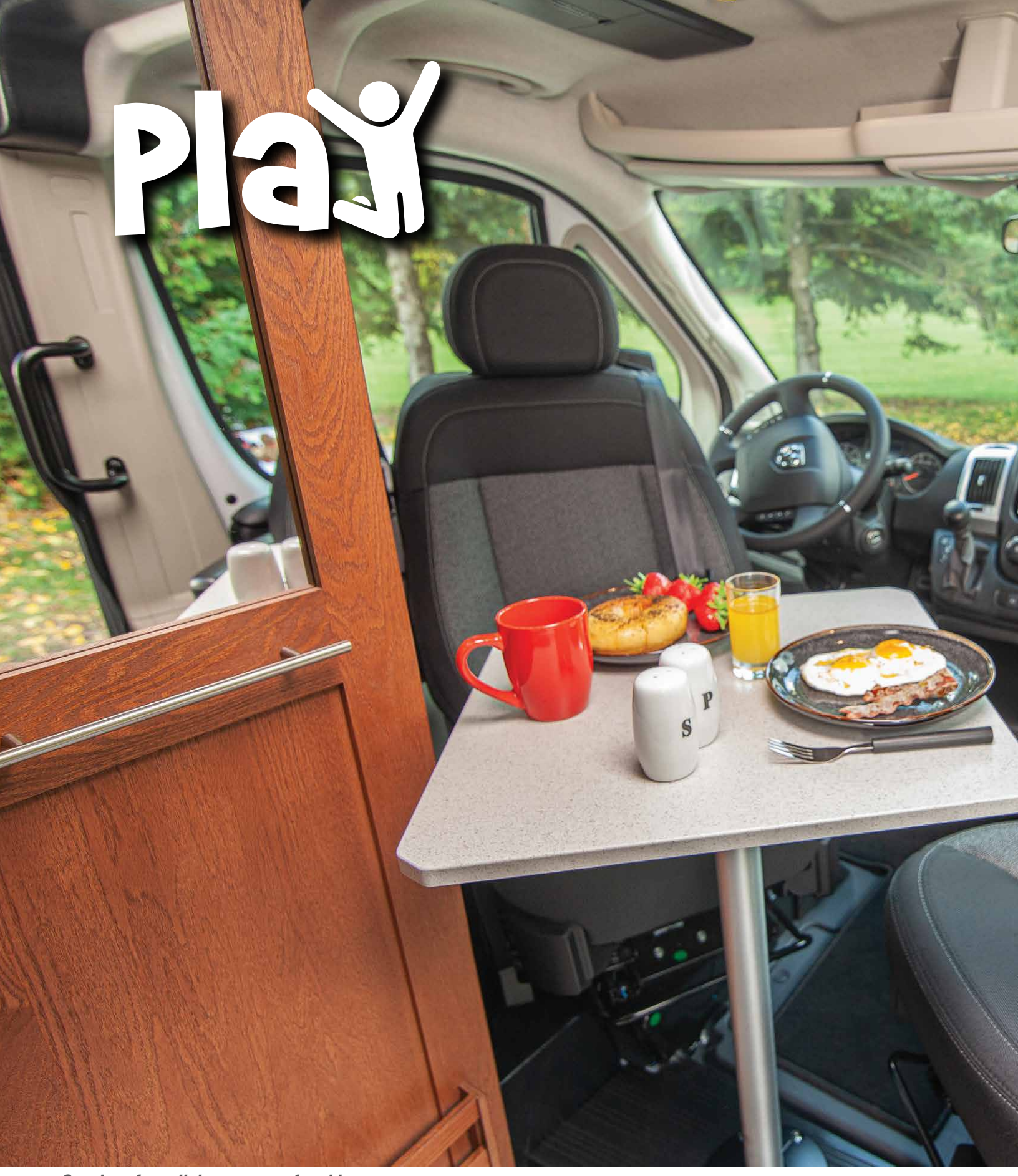
Spacious front dining area comfortably seats two.