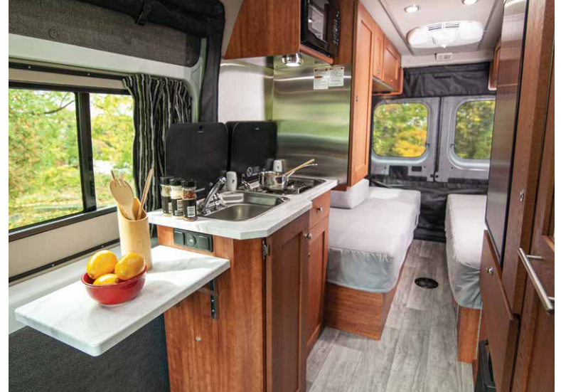
Kitchen galley includes a 5.0 cu.ft. refrigerator, microwave oven, two-burner propane stove, stainless steel sink and flip up counter extension.