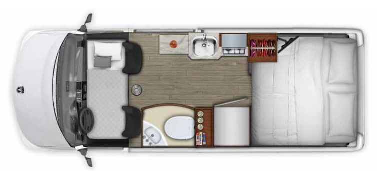
Interior floorplan evening with king bed set up. (Shown with optional front folding mattress.)