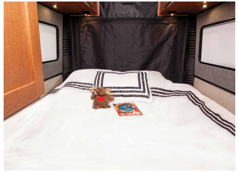
Rear lounge area easily transforms into a sleeping area with a comfortable king size bed.