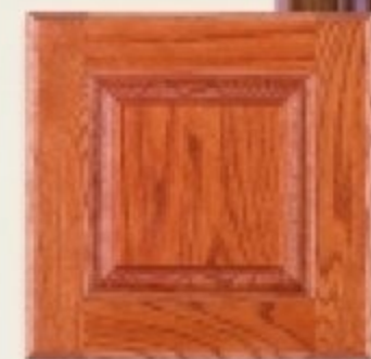
AUTUMN HAZE OAK (optional)