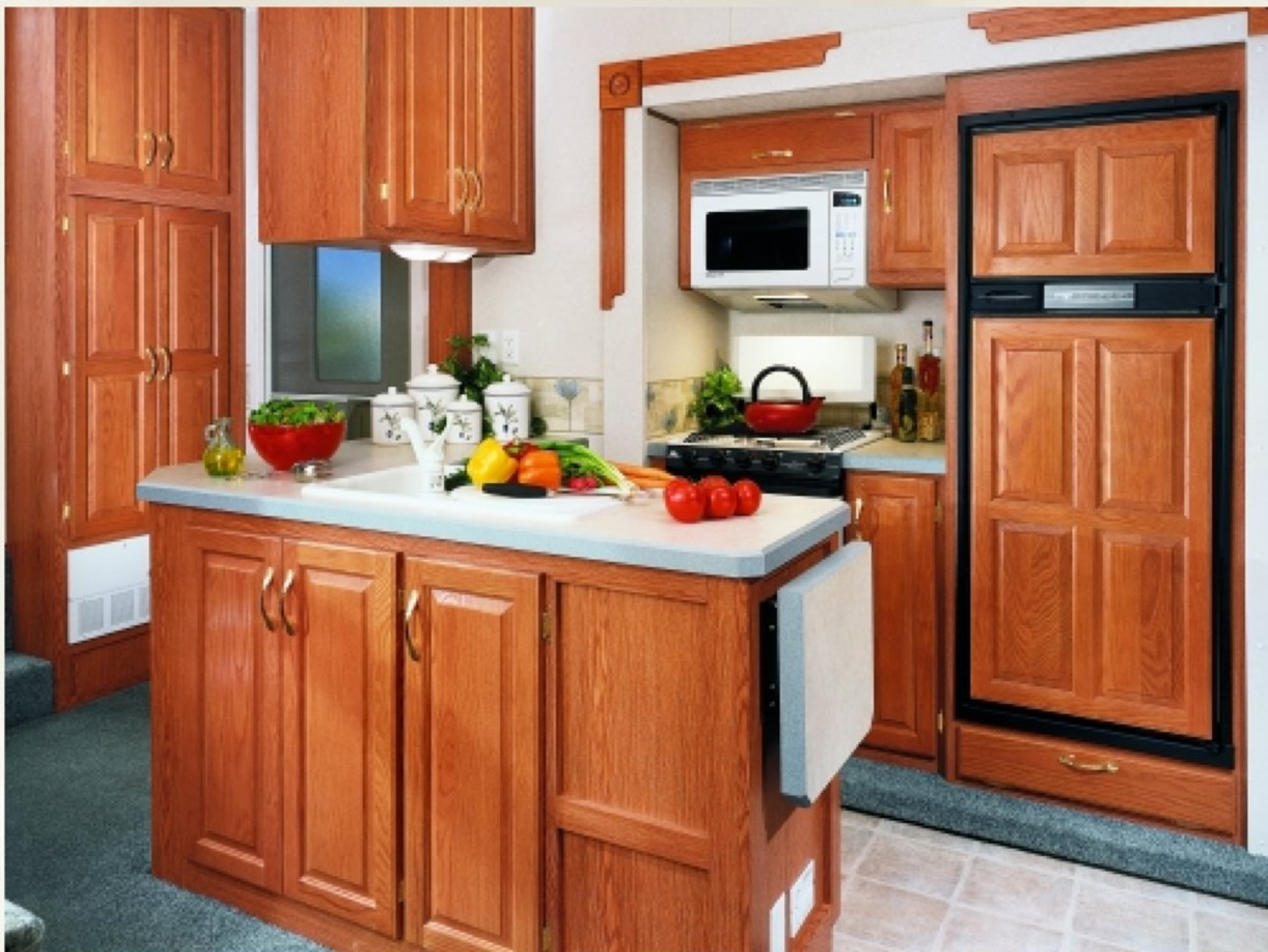
27RLD in Lakeside Blue with Autumn Haze Oak cabinetry.

Choosing a new RV is a big decision. The way we see it, the first time you step inside, you'd better say "wow." That's not a problem for people the first time they experience the Alumascape — in fact, it's their usual reaction. That's because every last detail is designed to give you a great RV experience at a great value. With dozens of options to help you customize your fifth wheel to your heart's content. And thirteen thoughtfully arranged floorplans to help make sure it's a love affair that lasts.