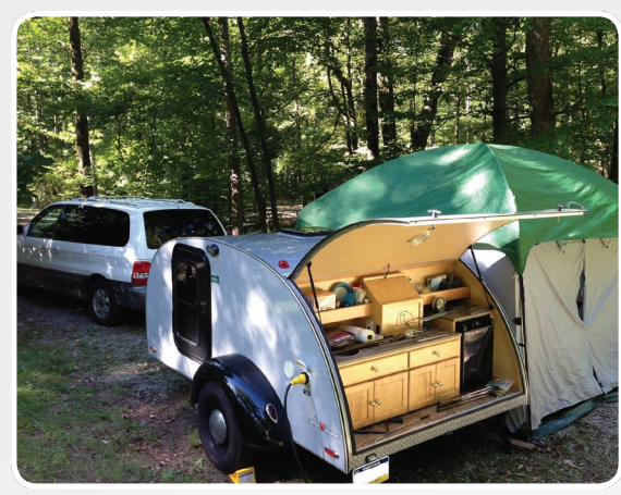
The 10' models come standard with California fiberglass fenders, baby moon wheels, a headboard with additional storage and deeper galley cabinets.

The Silver Shadow family is inspired by the retro teardrop trailer from the 1940's. Each come equipped with classic silver exterior and real birch wood interior. Every Shadow features 2nd floor storage and full height galley in the rear. While the 8' model can accommodate a sink, the 10' models offer the choice of sink, stove, sink/stove combo, fridge or pull-out cooler. \leftarrow \ll