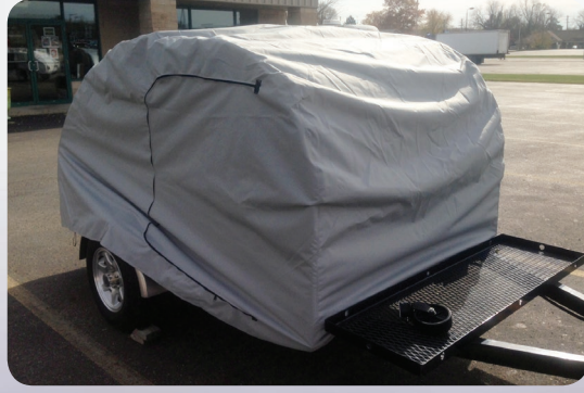
Cover- Protect your teardrop from UV, Acid Rain, Sap and much more...