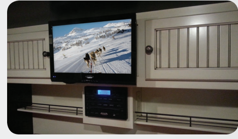
Sight and Sound- AM/FM/DVD Stereo with Bluetooth™ streaming audio, 12v, 19" LED TV and speakers provide a great entertainment center for all of your audio and video needs.