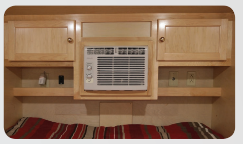
Air Conditioning— Enjoy 5000btu of cold air with our custom designed AC system complete with exhaust insulation shroud and intake fans. Available on myPod and 10' Shadows.