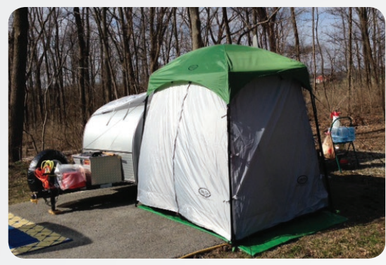
Custom 5x7 Tent – A smaller version of the 10x10 but with all the same benefits, specifically speaking, a place for privacy!