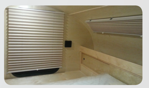
Window Shades— Who knew owning a teardrop would attract so much attention? Whether it is the sun or a set of eyes, these accordion night shades will keep them from peering in!