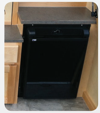
12v Fridge-Keep your food cool in this sleek, black, efficient 1.7 cubic ft upright fridge/freezer!