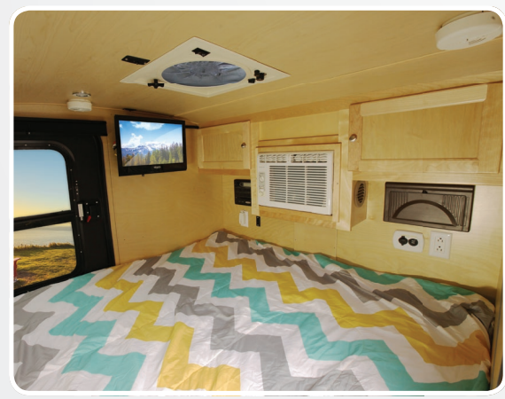
The 5' wide Shadows offer a queen sized sleeping area, while the 6' wide is more representative of a king. Another popular option that is only available in the 10' models of the Shadow family is embedded air conditioning.