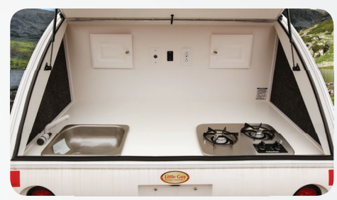
Sink & Stove— Brushing your teeth, rinsing off your dishes and cooking your food was never so easy — thanks to a large rectangular sink and 2 burner stovetop!