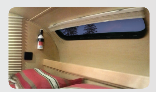
Stargazer Window— Are you looking to bring more light into your trailer or wishing to stare into the night sky? Here's your ticket!