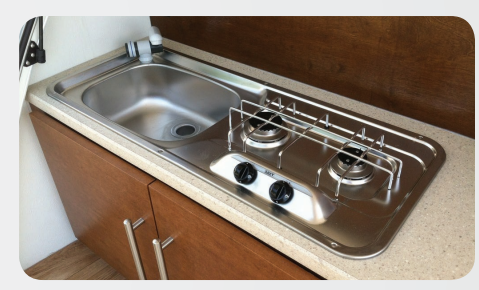
Sink/Stove Combo —Available in the 10' Shadow, this sink/stove combo is a nice alternative that allows you to save on space and capture more storage — all while doing it in style!