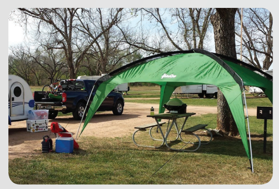
Cottonwood Shelter — Escape the rain or enjoy the shade with this lightweight dome that covers your key camping space.