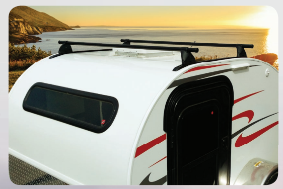
Yakima™ Roof Rack— Want to slap on a cargo basket, some skis or a kayak? Here's your answer! Available on all models except for the myPod.