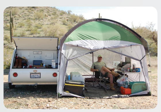
Custom 10x10 Tent — Gain 100 sq. ft. of living space (for your own use or to accommodate guests) with this multi-functional screen room & tent.