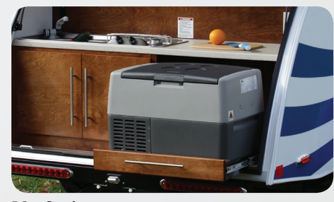
12v Cooler— Reach on over and down into this 1.6 cubic ft fridge/freezer — complete with slideout hardwood drawer for easier access!