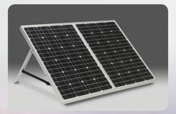
Solar Panel — Chase the sun and keep your trailer powered at all times! *Every trailer that leaves our building is prepped for solar charging.