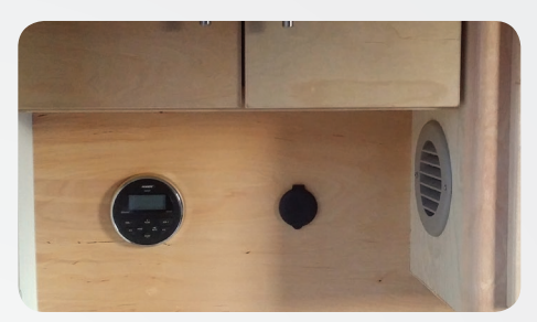
Bluetooth™ Stereo— This AM/FM Stereo with Bluetooth™ streaming audio, USB (for MP3) and ¹/₀" aux. input and speakers (interior/exterior) provide premium sound for your camping enjoyment.