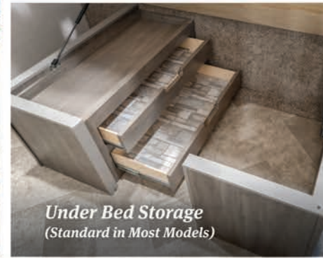
Under Bed Storage (Standard in Most Models)