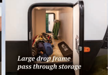
Large drop frame pass through storage