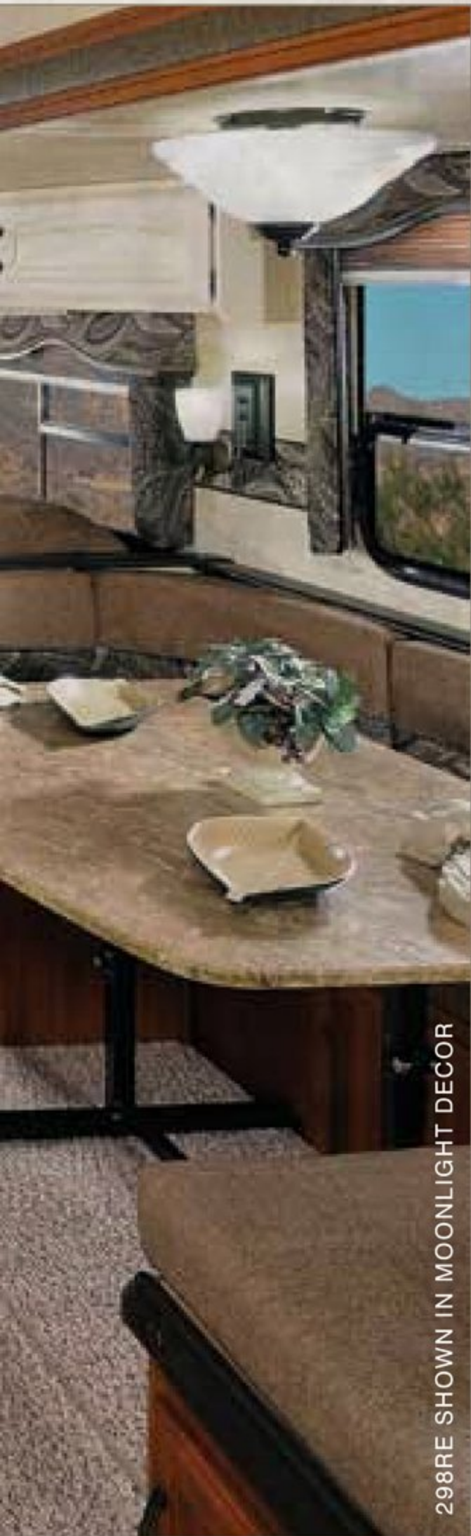
298RE SHOWN IN MOONLIGHT DECOR