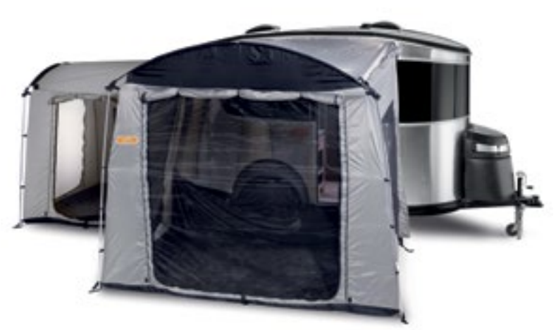
Keep the bugs out and the gear close with optional patio and rear tents.