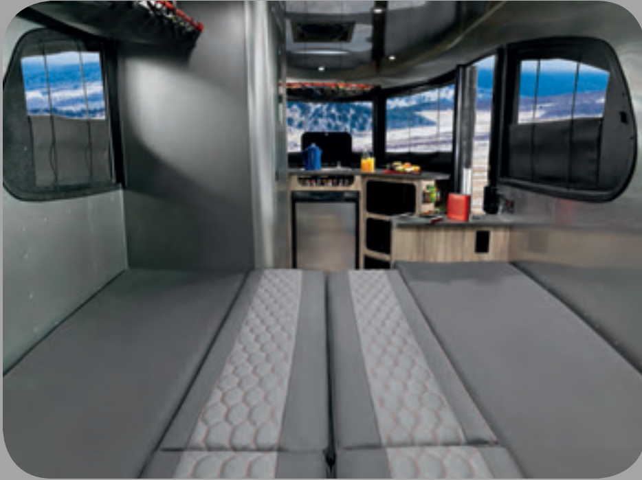
Full bed sleeping option – 76 in. x 76 in.