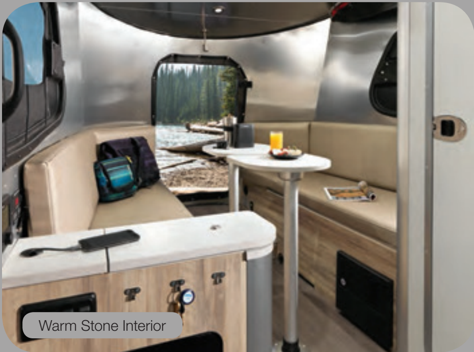
Warm Stone Interior