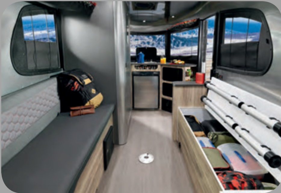
Bench storage – 11.5 cubic feet