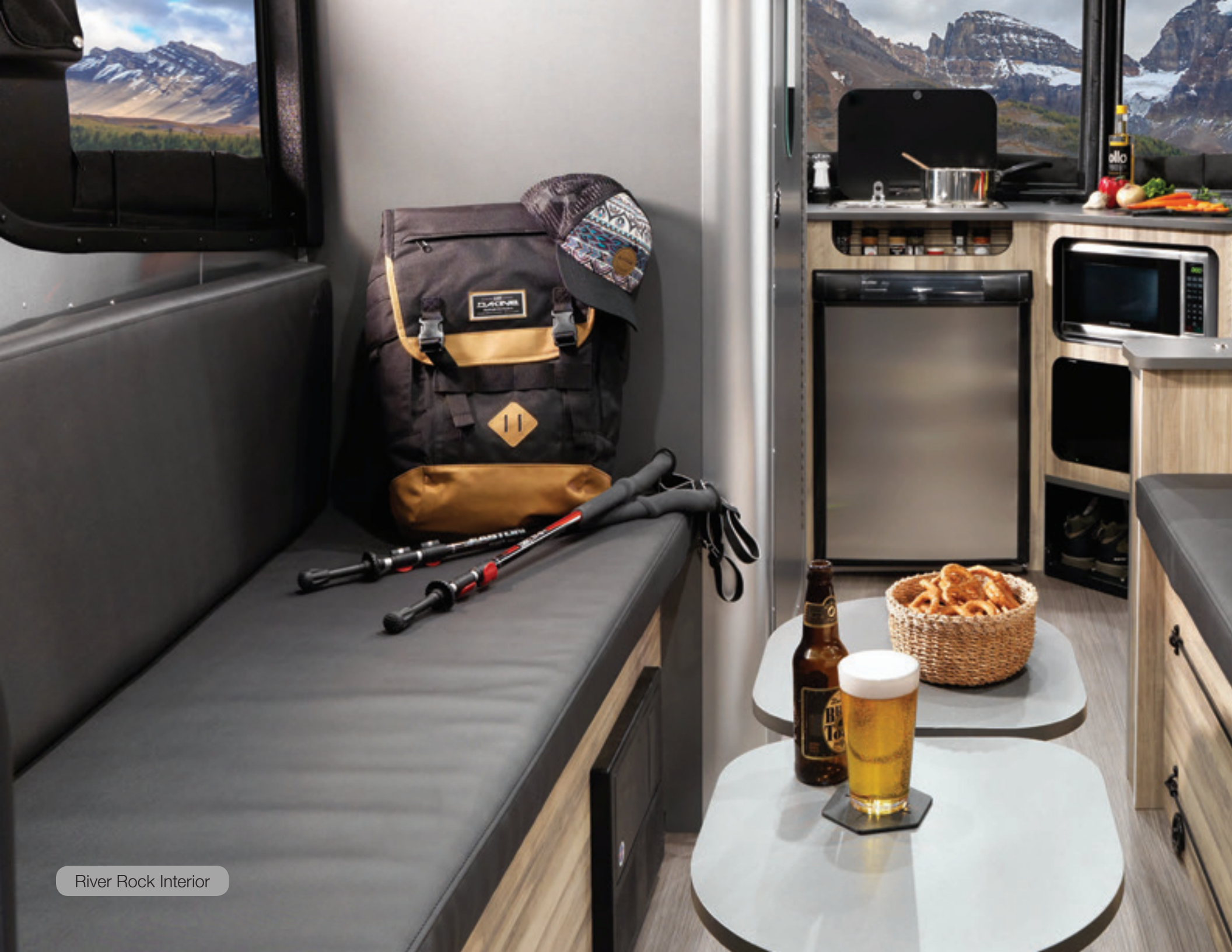
River Rock Interior