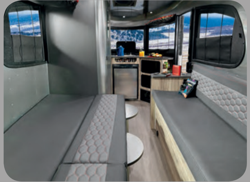
Half bed sleeping option – 38 in. x 76 in.