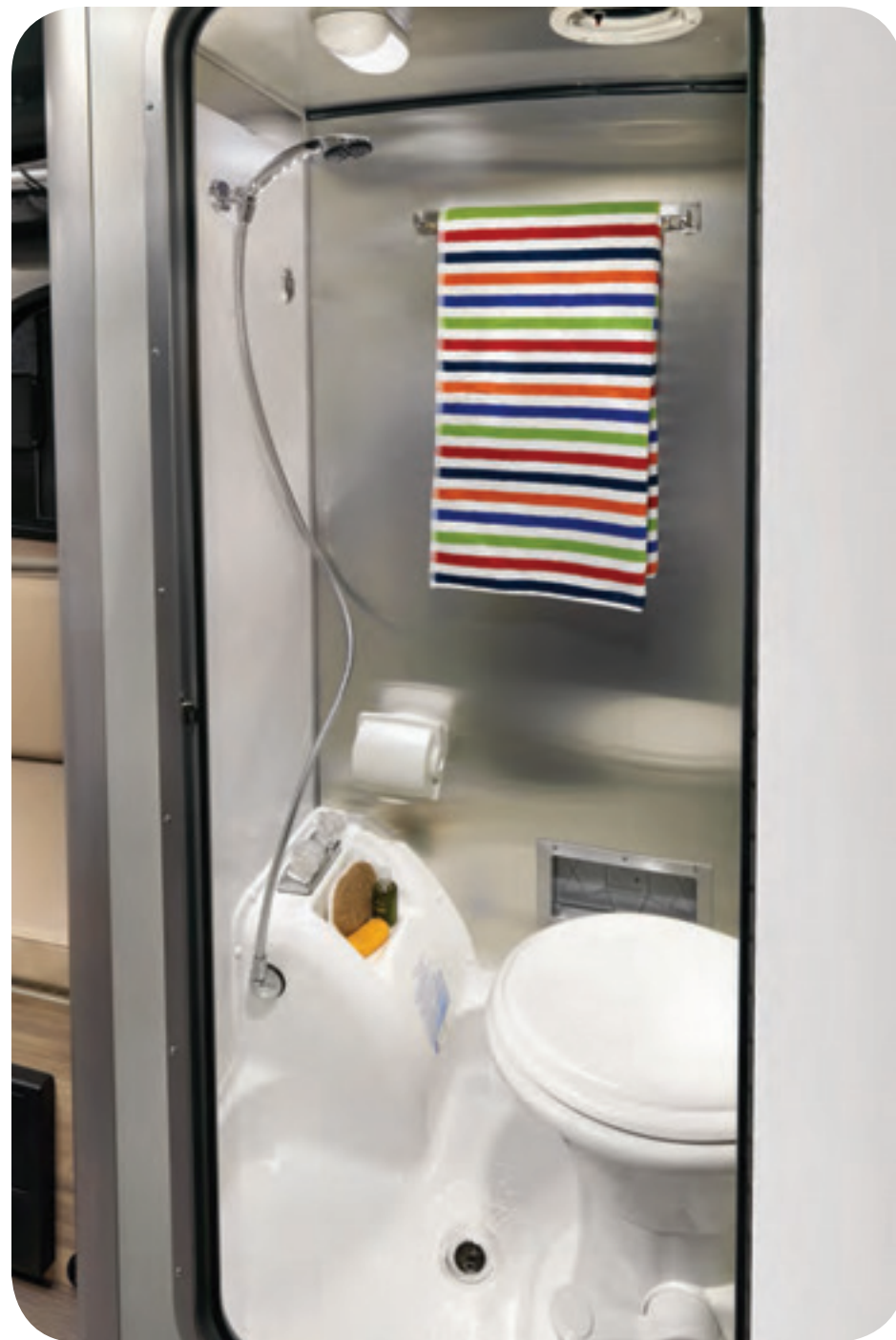
The full wet bath takes the sting (and stink) out of remote adventures.