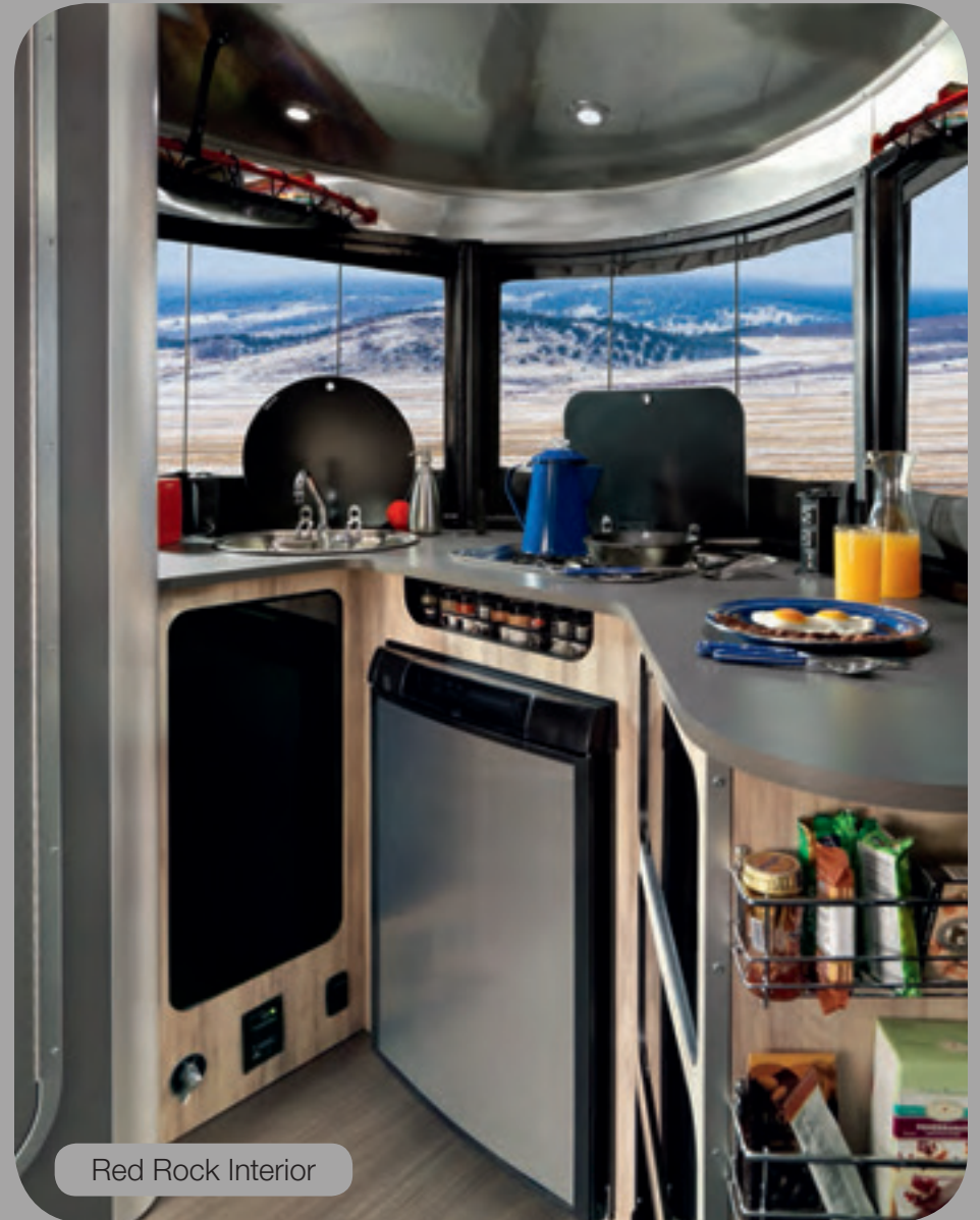
Red Rock Interior

The 2018 Airstream Basecamp is a sturdy, hypnotically beautiful escape pod packed with everything you need to live in complete comfort – whether you're off the grid, at a family campground or in a friend's backyard.