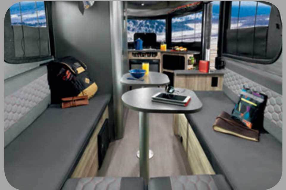
Group seating option – U-lounge seating for 5