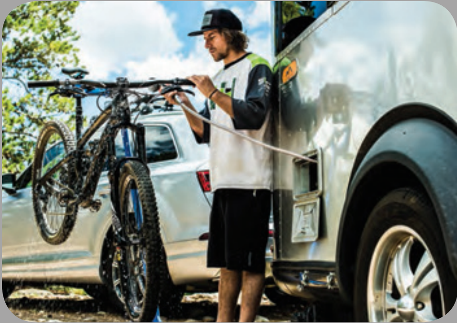
The pass through water access makes a handy unisex/unisport outdoor shower.