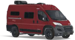
DEEP CHERRY RED