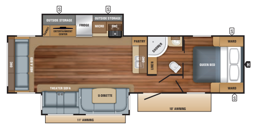
WHITE HAWK | 31RL OPTION A Ext. Lgth: 36' 11" Ext. Ht: 136" Unloaded Wt. (lbs): 7,560 Sleeps: 4-6