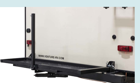
Bike rack/cargo tray with 250-pound capacity (option).