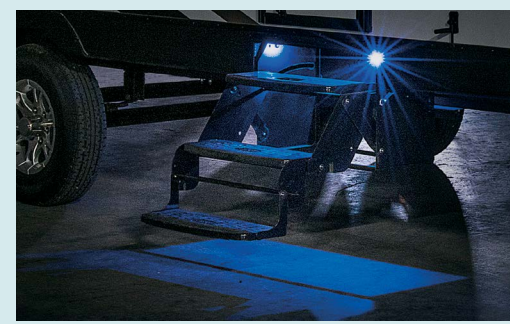
Safety step is triple step with built-in blue LED safety light.