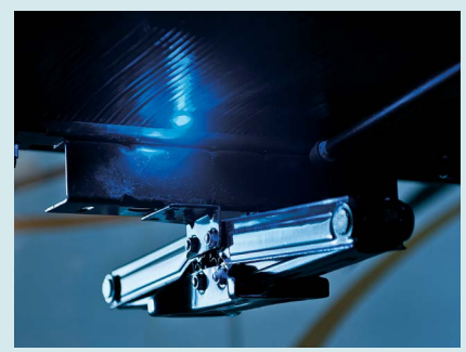
Blue LED light is found above each stabilizing jack as well.