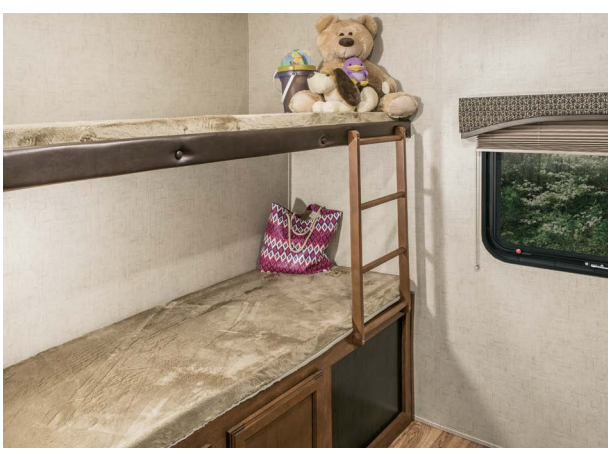
Kids will love the 327VIK's three bunks, removable table, and a sofa that converts into a fourth bed.

(Above) In the 327VIK, the hutch adds additional storage and countertop space for your coffeemaker, blender, toaster and other indispensable camping appliances! All SportTreks provide a large panoramic window, bringing the outside in.