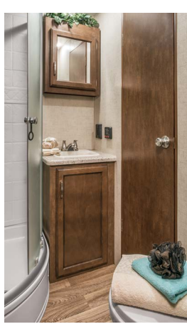
SportTrek baths include a foot-flush porcelain toilet, multi-shelf shower or tub, designer shower curtain and mirrored medicine cabinet. The 327VIK shown includes a 34-inch shower with radius glass doors.