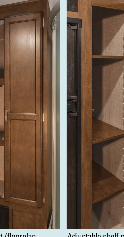
Linen closet (floorplan specific).

Safe-Tek<sup>®</sup> box with USB charger allows safe/ hidden charging for your electronic devices.