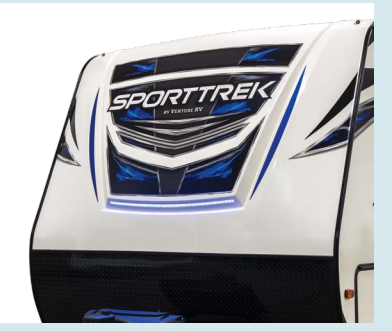
Optional 3/4 fiberglass front cap with upgraded graphics.