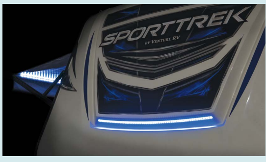
Optional 3/4 front cap with upgraded graphics.