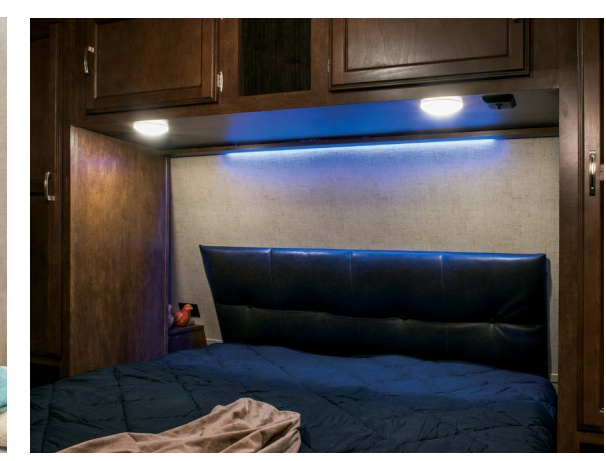
Bedrooms include designer padded headboard, overhead storage, full-length closet(s) with easyaccess nightstands including USB port, and Sleep Tight<sup>®</sup> memory foam mattress. Most floorplans offer two nightstands, 110V outlets for C-PAPs, clock...