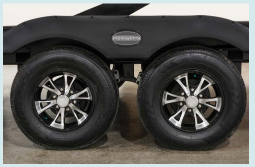
Optional 15" high polished, black-accented aluminum wheels.