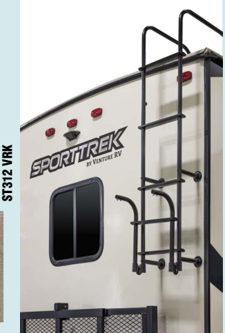
This sturdy ladder (for easy roof access) is part of the Travel Trailer Trail Package.