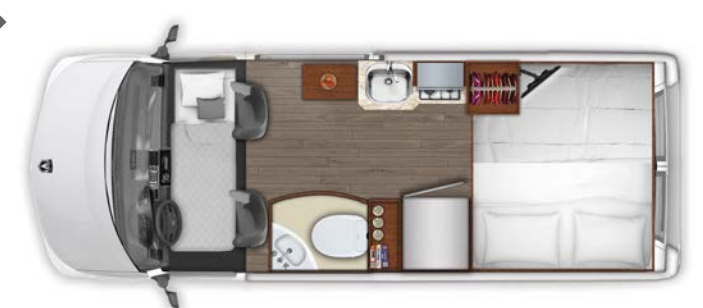
Interior floorplan of Simplicity SRT during the evening