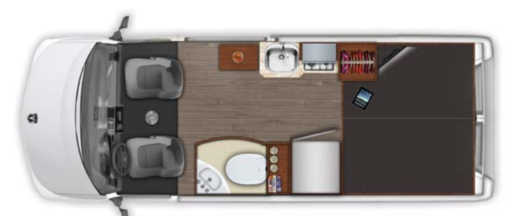
Interior floorplan of Simplicity SRT during the daytime

Take a step into your beautiful new Simplicity SRT by Roadtrek. As you turn from your driver's seat, you'll find a pop-in table to enjoy a card game or a nice meal. Looking ahead to your kitchen, you'll be able to prepare a delicious meal on your 2-burner propane stove, and keep your groceries fresh in your 5 cu. ft. refrigerator. You'll have ample storage space in the kitchen including a pullout pantry and a deep pot drawer. As you make your way through the galley, you'll find a comfortable and spacious permanent bathroom with stand-up shower, and finally arrive to your fixed queen bed with additional storage undearneath. End your day relaxed; watching your favorite movie on the optional 24" flat screen television.