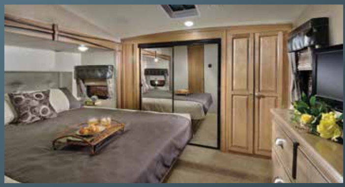
Spacious Bedroom with Residential Queen Bed Slide and Full Width Closet.