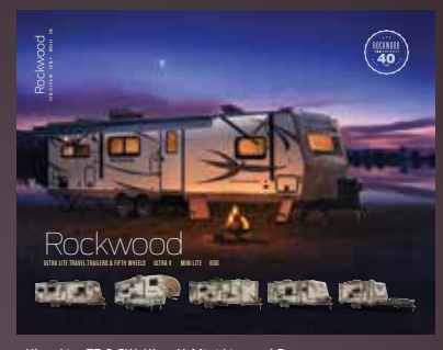
Ultra Lite TT & FW, Ultra V, Mini Lite and Roo