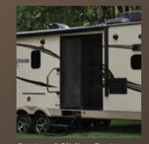
Optional Sliding Patio Door (8315BSS Only)