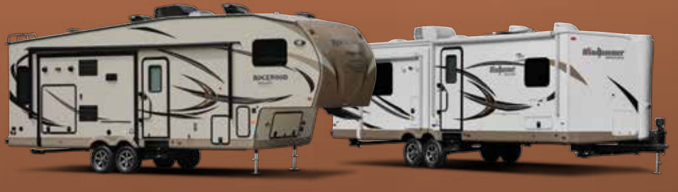
Diamond Package Exterior

To continue this tradition, Rockwood offers a group of appealing features to enhance the appearance of the Signature Ultra Lite & Windjammer series. The Diamond & Platinum packages add style and luxury as demonstrated in the pictures of the 3029W on page 6, the 8315BSS on page 8 and the 8288WSA on page 10. The Diamond Package includes: Champagne colored high gloss fiberglass and color keyed roof, while the Platinum Package has White high gloss fiberglass and white roof.