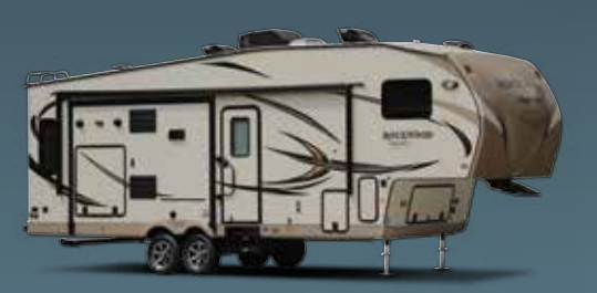
Diamond Package Exterior