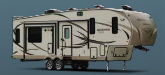
Diamond Package Exterior

The Unloaded Vehicle Weight (UVW) listed represents the weight of one trailer with tha model's standard equipment including the content of specified Option Packages.