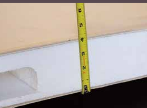
4" thick roof with built in insulated A/C ducts