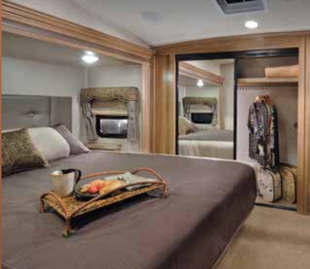
Spacious Bedroom with Residential Queen Bed Slide and Full Width Closet.

Rockwood Fifth Wheel models are loaded with features like the Reese Revolution hitch, power stabilizer jacks, slam latches on most storage doors and much more.