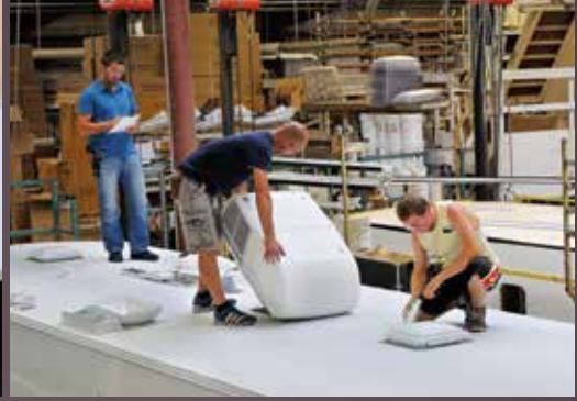
Built strong to enable you to conveniently perform periodic roof maintenance.