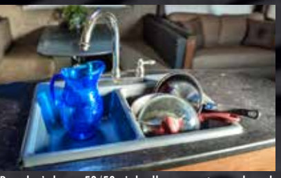
Prowler's large 50/50 sink allows you to wash and rinse residential pot and pans with ease.