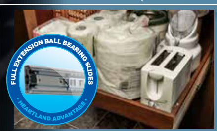
Strong, steel ball bearing, full extension design allows much larger and deeper drawers.