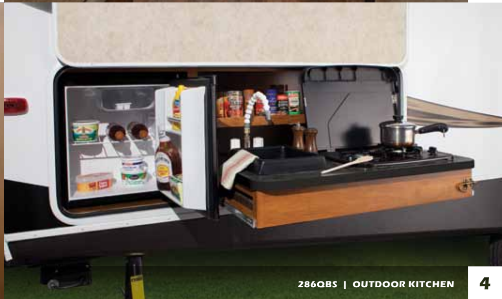
286QBS | OUTDOOR KITCHEN

Enjoy the amenities of an outdoor kitchen without having to pull all of the weight of a traditionally built travel trailer. The 286QBS weighs in at approximately 5250 lbs.!