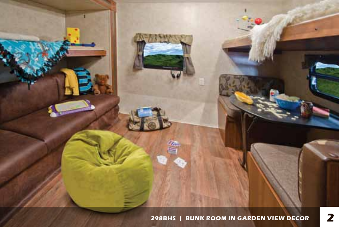
298BHS | BUNK ROOM IN GARDEN VIEW DECOR