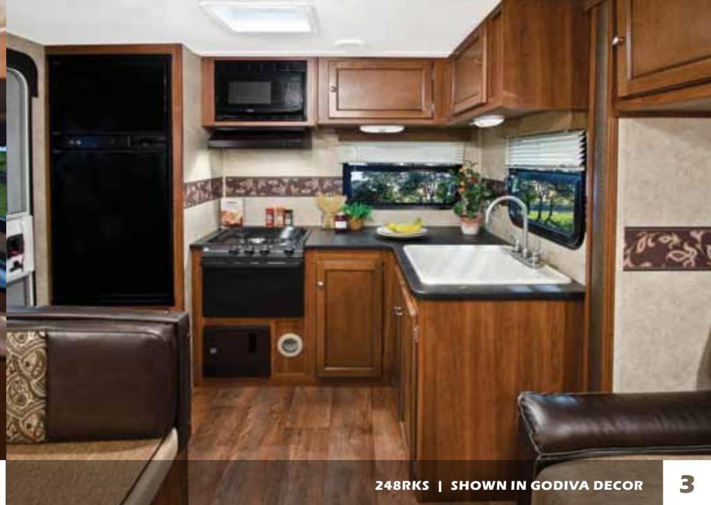
248RKS | SHOWN IN GODIVA DECOR