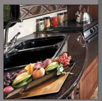
Optional solid surface counter top