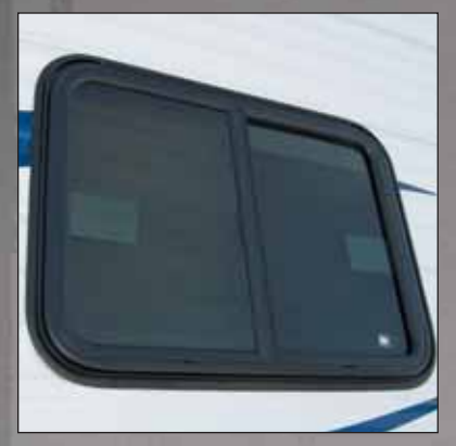
Tinted safety glass windows