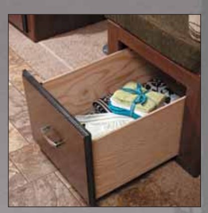
Storage drawers under dinette seating