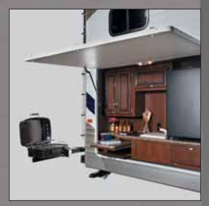
Cook-Out kitchen with optional grill