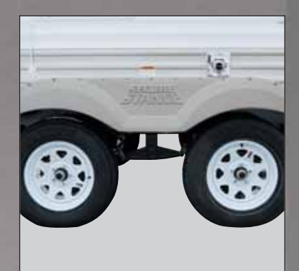
Secure Stance axles with Nitro filled radial tires