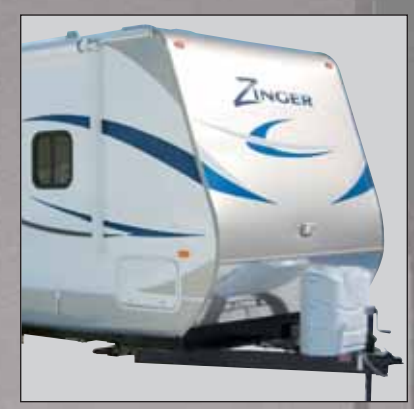
Optional full body fiberglass with standard stone guard