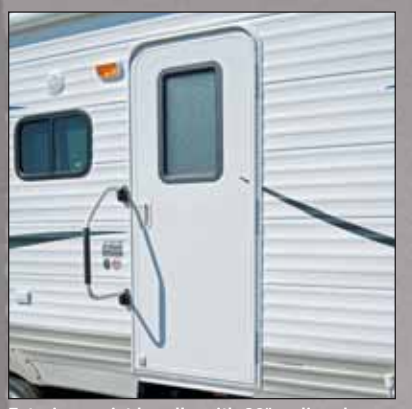
Exterior assist handle with 30" radius door