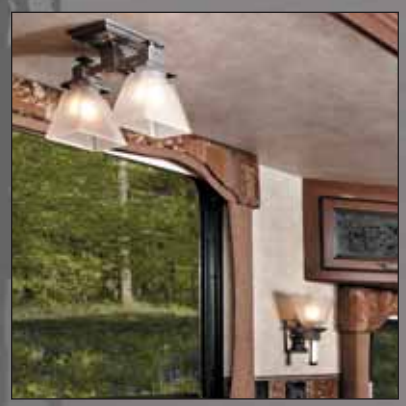
Interior decorative lighting