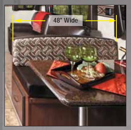
48" Super booth dinette