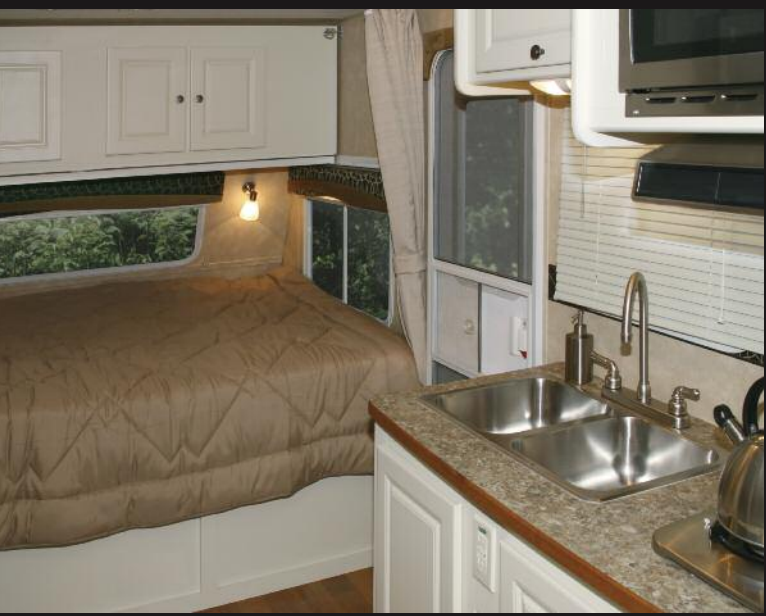
The X189FDS truly maximizes all available space. The electric slide features a 6 cu. ft. double door refrigerator and a spacious dinette. Large windows and bright décor give this lightweight a "big" feel.