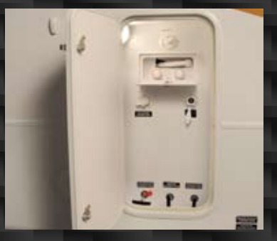
Wildcat's convenient docking station provides easy set up with all hook ups at one location. (Except 110v power cord)