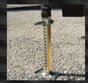
Hydraulic landing gear on Fifth Wheels (Optional) 10 times faster than conventional electric jacks. Quick release pins on Fifth Wheel feet. (Standard)