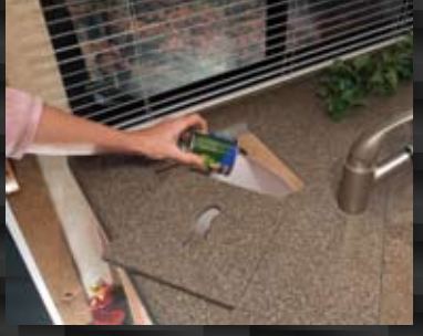
C.T.S. (Central Trash System) Special to Wildcat. You're able to throw your trash away and remove it by opening an outside baggage door. Our competitors make you walk down four steps.