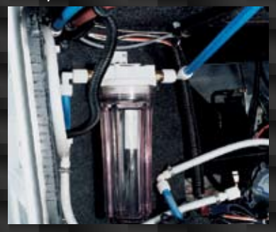
The water filtration system provides safe clean drinking water through all the water lines and water heater.