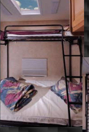
The rear bunk beds in the 31THSB fold up and out of the way so you can roll in your toys, or if you just need additional storage space.