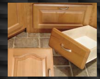
New multi-profiled raised panel doors with radius edges. This residential door and drawer front is normally reserved for high end products. It's standard on your Wildcat!