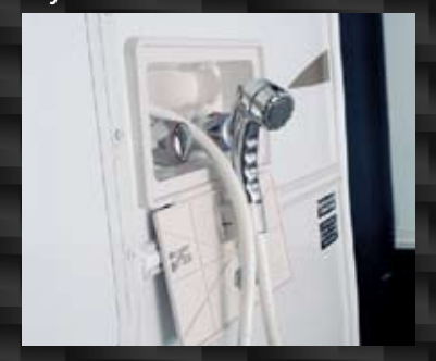
The hand-held, outside shower option provides quick clean-ups.