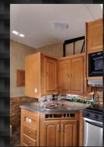
Wildcat's innovative E-Z Load Automated Cabinet System makes sure all family members from the smallest to the tallest are able to reach every storage area with the click of a button.