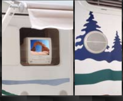
The 32QBBS features an outside entertainment center with a swivel T.V. pedestal to watch the game outdoors. A clear safety glass front ensures no bugs get in and no air conditioning gets out.

The standard outside entertainment center includes (2) stereo RV marine speakers and cable jacks to plug your