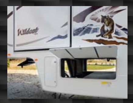
Wildcat's pass thru storage gives you plenty of room to store your important belongings with easy access at any time.