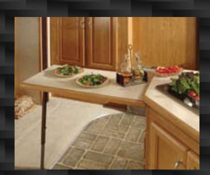
Counter extension gives the Wildcat 75% more countertop work space. A first at this price point.

(Right) Forest River's Exclusive CD / DVD 10 + 2 ,AM/FM with Upgraded Remote. This is a12V system great for dry camping.