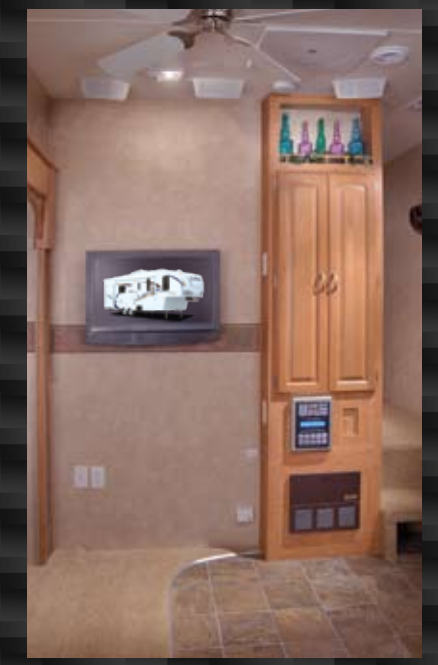
Wildcat's entertainment center will provide unlimited entertainment.

(Right) Forest River's Exclusive CD / DVD 10 + 2 ,AM/FM with Upgraded Remote. This is a12V system great for dry camping.