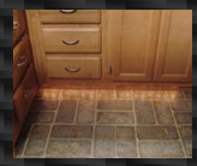
Floor track lighting is standard in all Wildcats letting you see where you walk at night. Great for the kids.