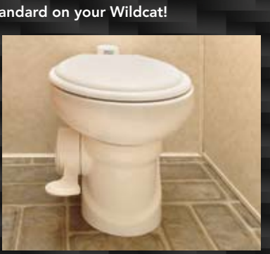
Wildcat bathrooms come standard with residential-style porcelain foot flush toilets.