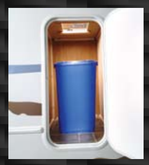
C.T.S trash can is accessible from the outside baggage door as shown above. (N/A West Coast)