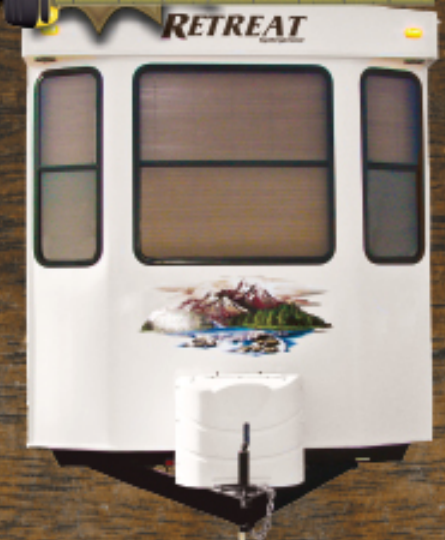
8' 6" Wide Body