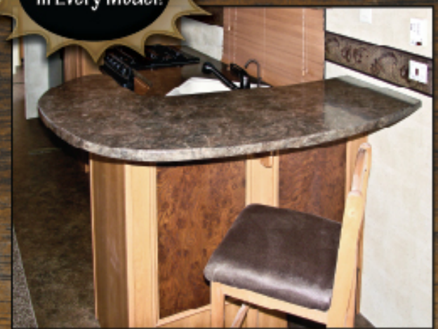
Eat in Bar