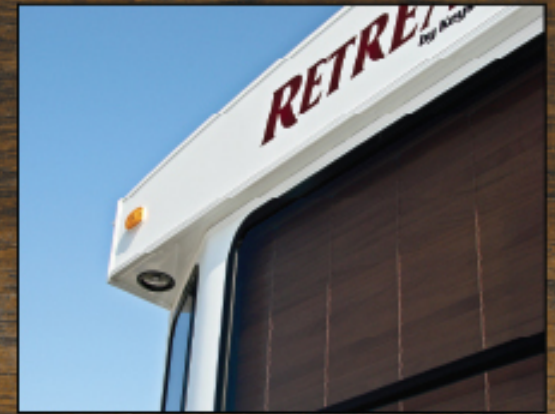
Outside Soffit Lighting