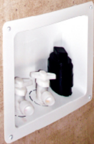
Prepped For Washer and Dryer