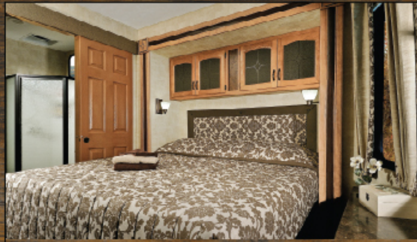
King Size Bed with Overhead Storage