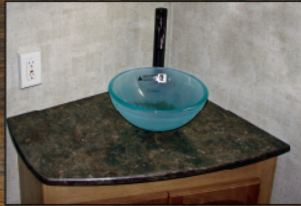
Vessel Bathroom Sink