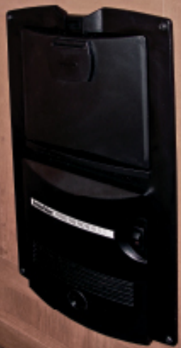
Central Vacuum Cleaner