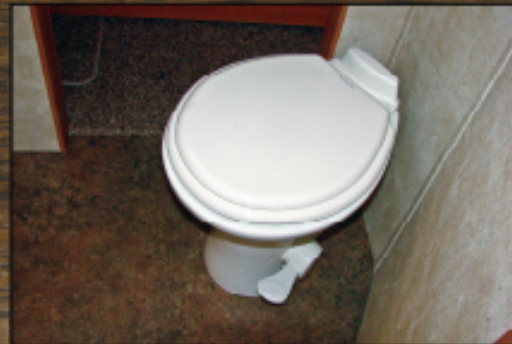
Porcelain Foot Flush Toilet