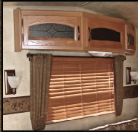
Wooden Window Blinds