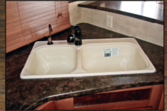
Extra Large Kitchen Sink with Pull Out Sprayer