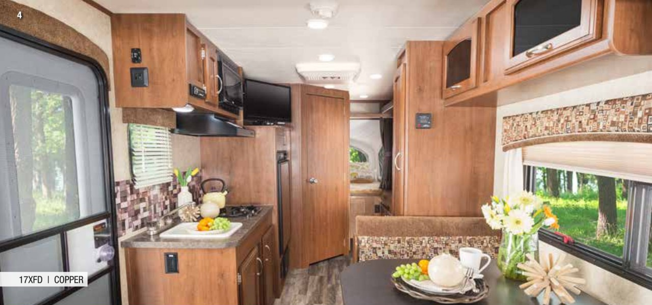
17XFD | COPPER