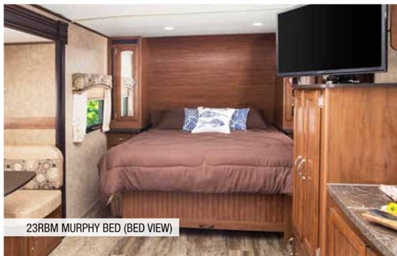
23RBM MURPHY BED (BED VIEW)