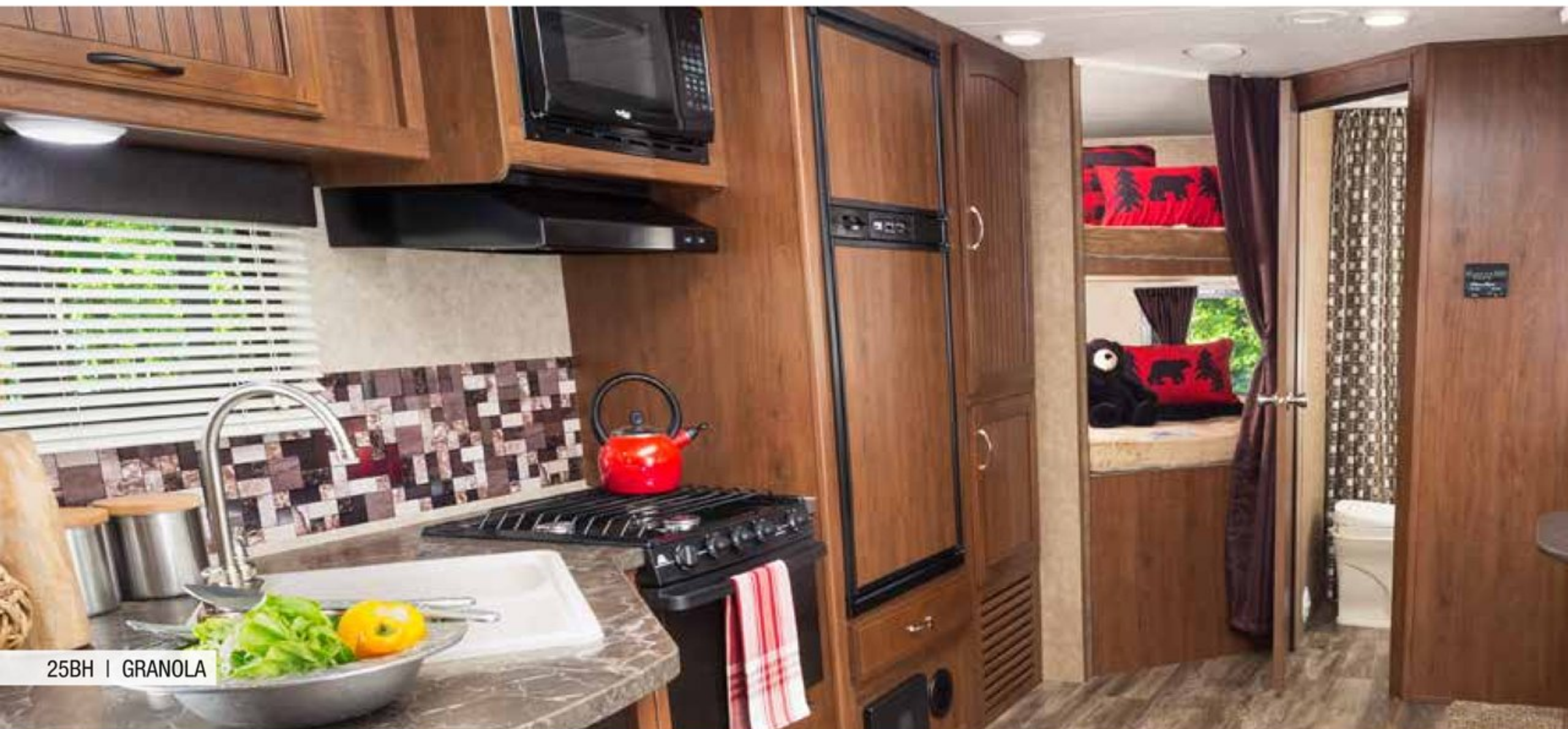
25BH | GRANOLA

We've packed tons of comfort and fun into this tow-friendly ultra-lite. Pair that with tough, sturdy construction and this trailer will help you make memories for years to come.