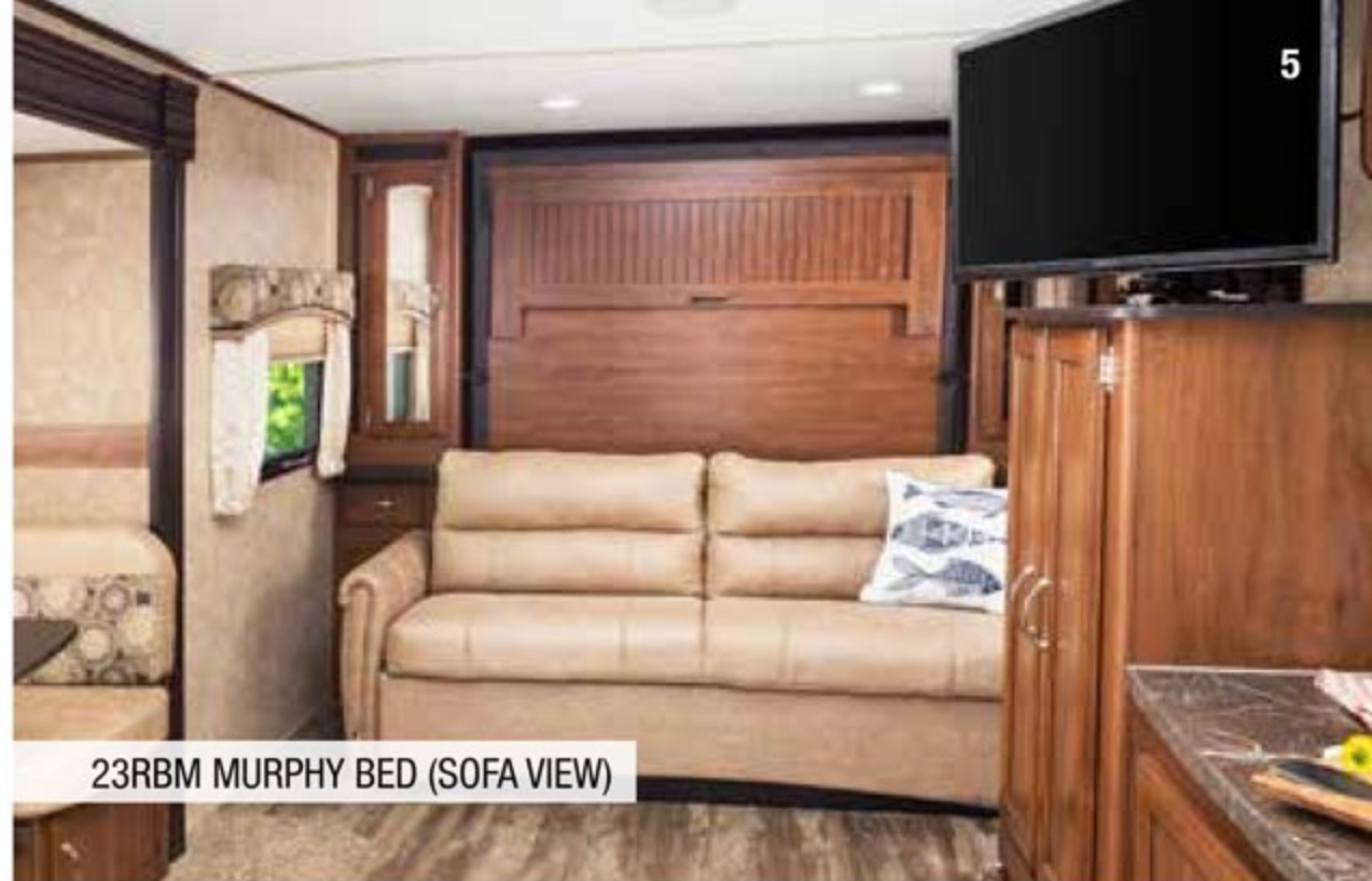
23RBM MURPHY BED (SOFA VIEW)