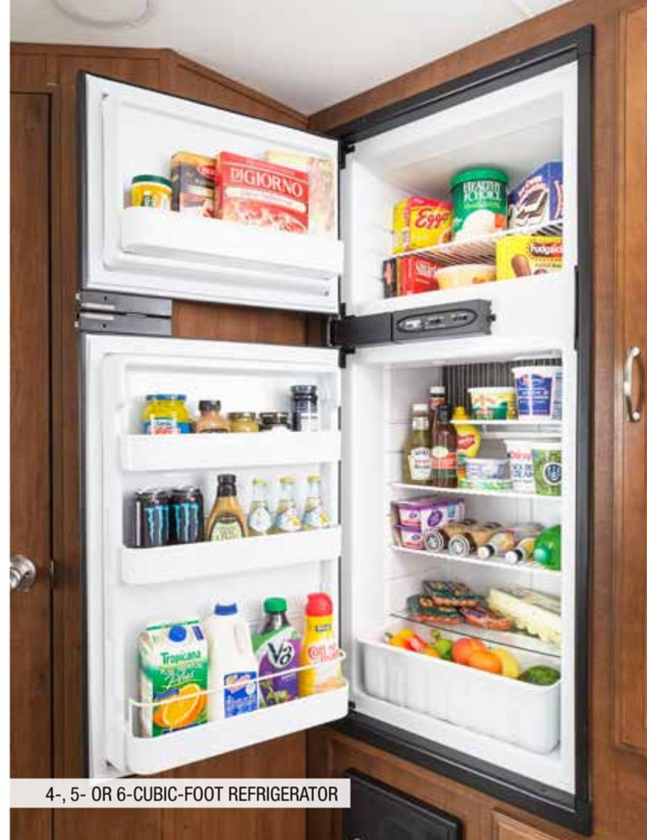
4-, 5- OR 6-CUBIC-FOOT REFRIGERATOR